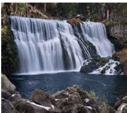
Middle Falls in the Summer