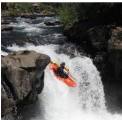
Kayaking Lower falls

Is a six mile long drive located approximately 5 miles east of McCloud on Highway 89. The drive takes you past three of the most beautiful waterfalls anywhere; Lower, Middle, and Upper Falls. There's a hiking trail that connects the three falls. In the summer drive to any of the three parking areas and find the marked trail.